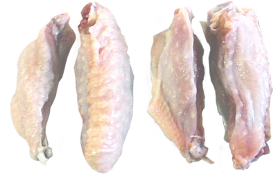
Split chicken mid-wings after CMWS-2