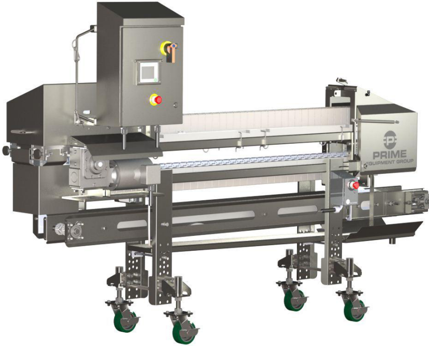
60 inch loading model shown